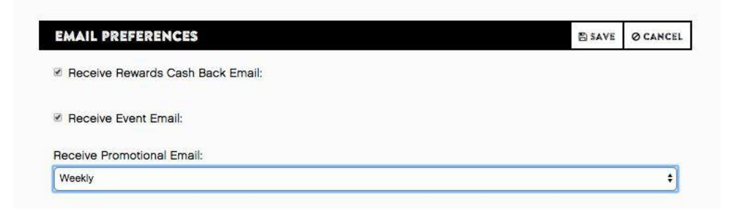
Figure 2: Example Message Preferences

Cheetah Loyalty includes pre-built email and push preferences for each member, such as opt-ins for receiving types of email and the frequency for receiving those emails. Marketers can view and edit these message preferences on web apps, mobile apps, and on the Member CSR screens. Cheetah Loyalty's Message module respects these pre-built message preferences when sending messages to recipients.